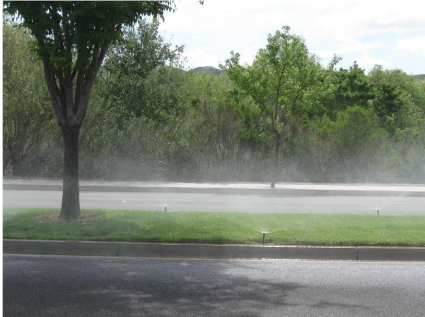
Station 25: Non LittleValve area Excessive misting and overspray