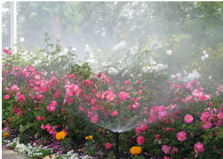
Station 1: Non LittleValve area Excessive misting and overspray