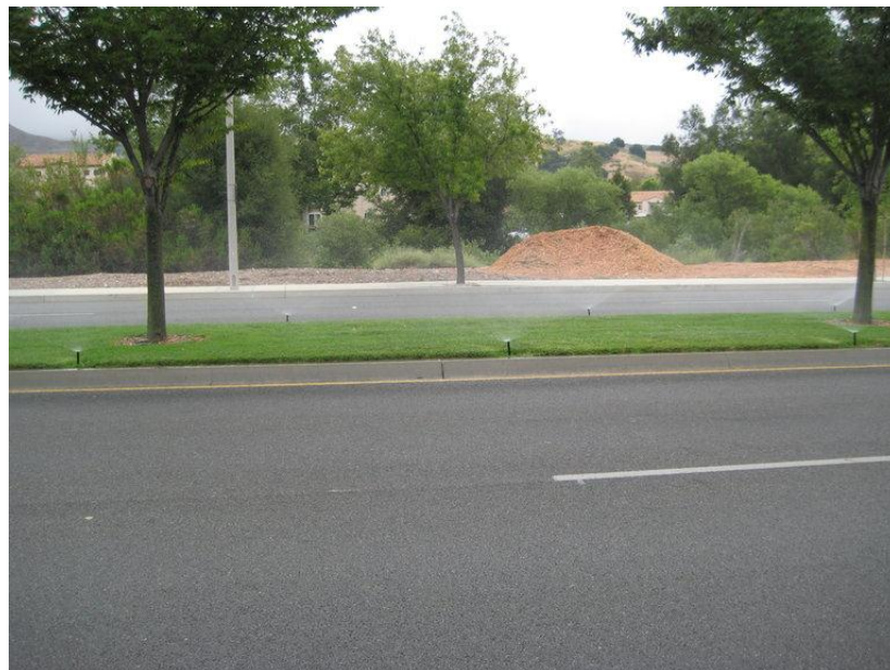
Station 24: LittleValve area No misting. No overspray